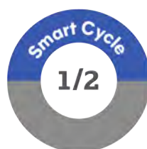
Frozen Oocyte Transfer (FOT)