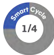
Coverage of Donor Sperm 4 vials