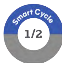
Pre-Transfer Embryology Services