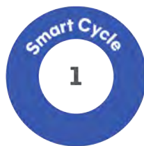
Coverage of 1 Cohort of Donor Eggs 6–8 eggs