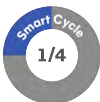
Frozen Embryo Transfer (FET)