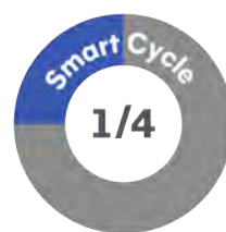
Split Cycle (Egg & Embryo Freezing) When paired with IVF cycle