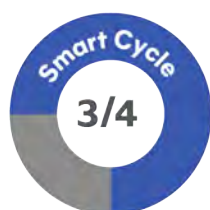
IVF Fresh Cycle

Visit the Explanation of Covered Treatments & Services section of the Member Guide to learn more. For a full explanation of what's covered under each Smart Cycle, visit the Included in Your Coverage section.