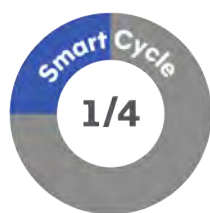
Intrauterine Insemination (IUI)