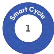
IVF Live Donor Fresh Donor services and creation of embryos including transfer to member